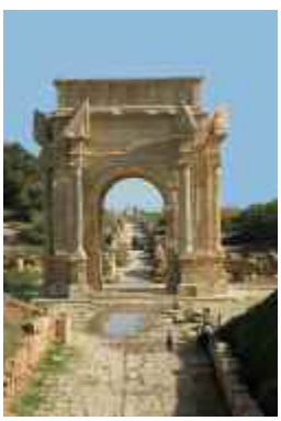
On the cover: The Arch of Septimius Severus at Leptis Magna.